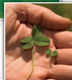
Traditional clover vs. to Microclover®